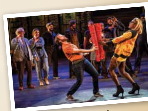
KINKY BOOTS, BEST LARGE MUSICAL 2022

Visit paramountaurora.com or call 630.896.6666