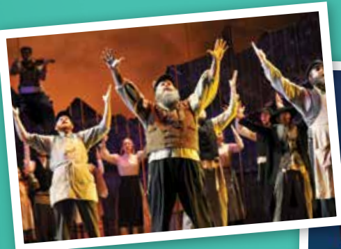
FIDDLER ON THE ROOF 2013

Thank you for making memories with us. We hope you'll subscribe to the 2024 / 2025 season, and together, we'll create more moments that will last us a lifetime!