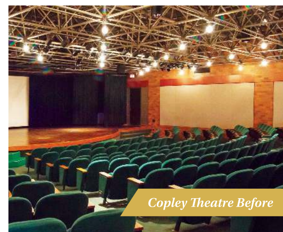
Copley Theatre Before

The theater is not the only area that received a facelift. A new bar, located within steps of the Copley doors, is in the process of being finished, as well as a new Copley Box Office. All of these spaces will make their debut this November when Second City returns.